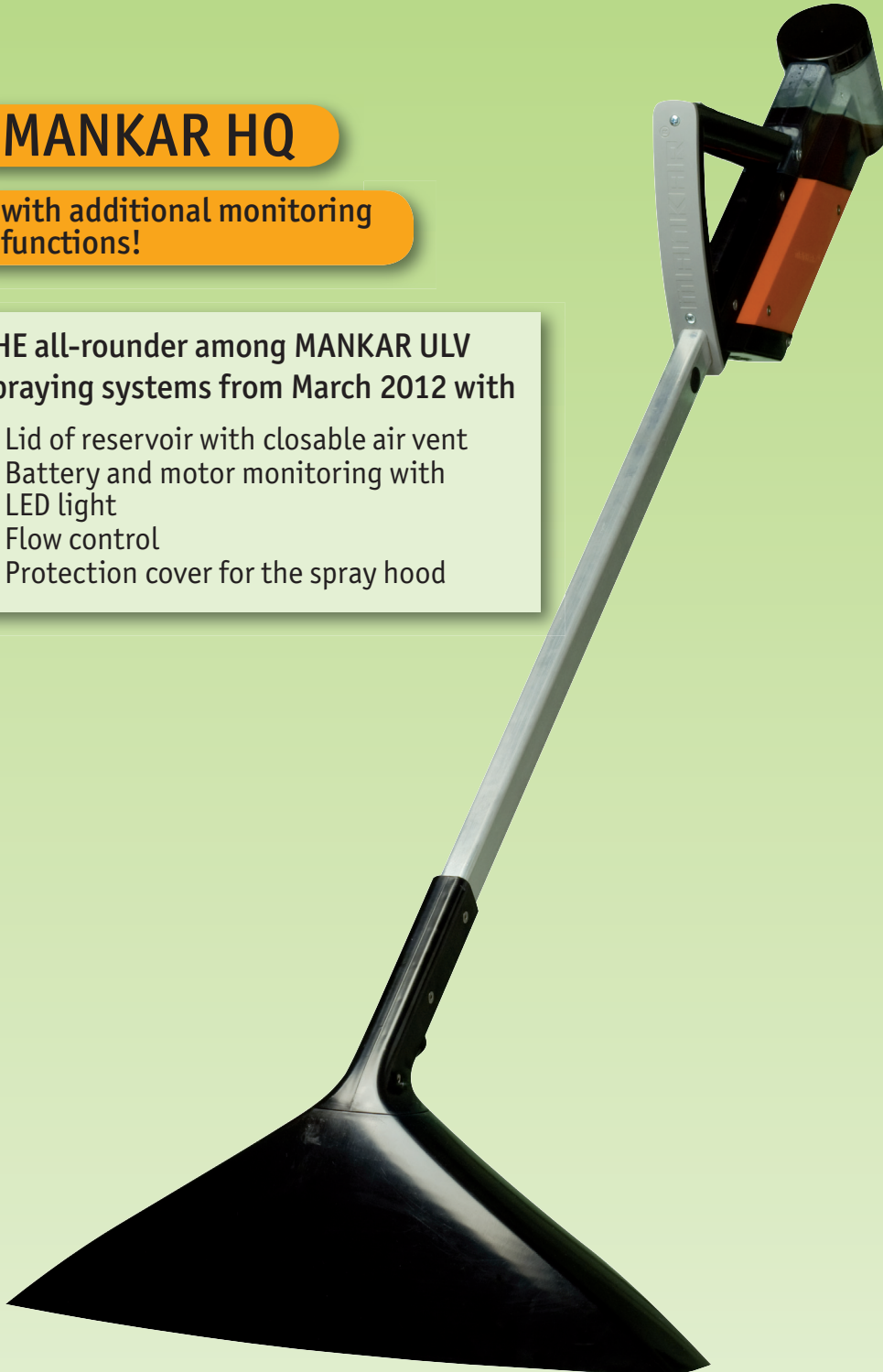
Lid with closable air vent